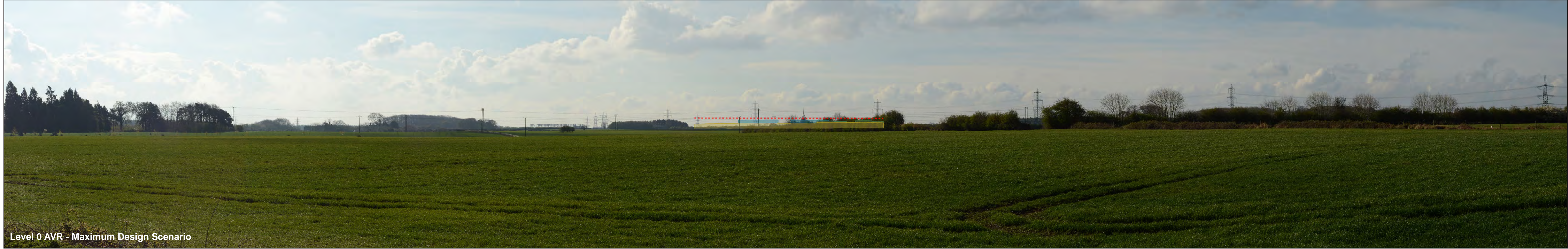
Figure: 16 Viewpoint 8: Minster Way

EBI and Substation Area (15m Height) EBI Buildings (20m Height) Substation Buildings (25m Height) Lightning Protection (30m Height)