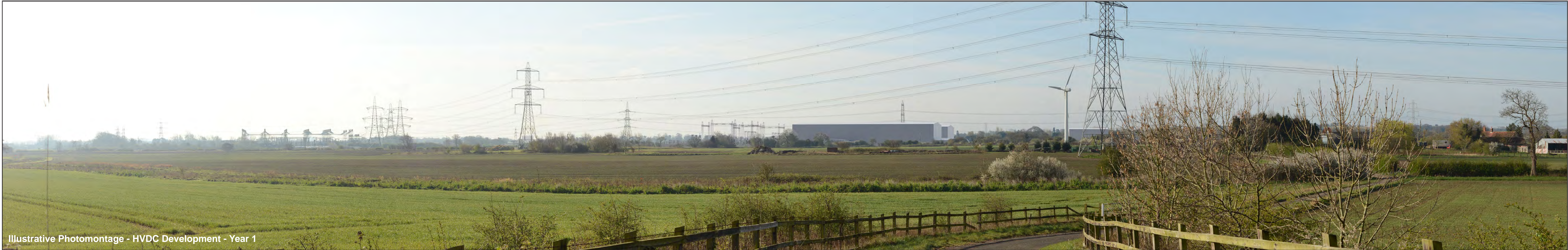
Figure: 8 Viewpoint 3: Footbridge over A1079

OS reference: 503831 E 435980 N Horizontal field of view: 90° (cylindrical projection) Camera: Nikon D600 AOD: 17.00 m Principal distance: 522 mm Lens: AF 50mm f/1.8D Direction of view: 175° Paper size: 841 x 297 mm (half A1) Camera height: 1.5 m AGL Distance to site: 0.67 km Correct printed image size: 820 x 260 mm Date and time: 04/04/2019 08:15