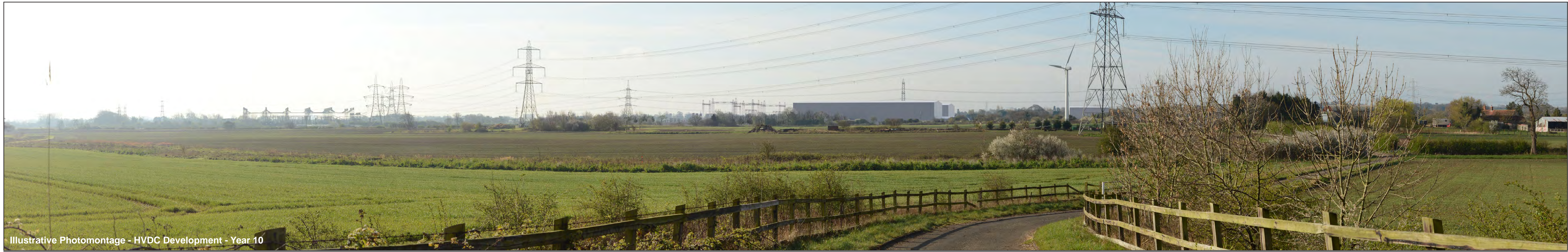
Illustrative Photomontage - HVDC Development - Year 10