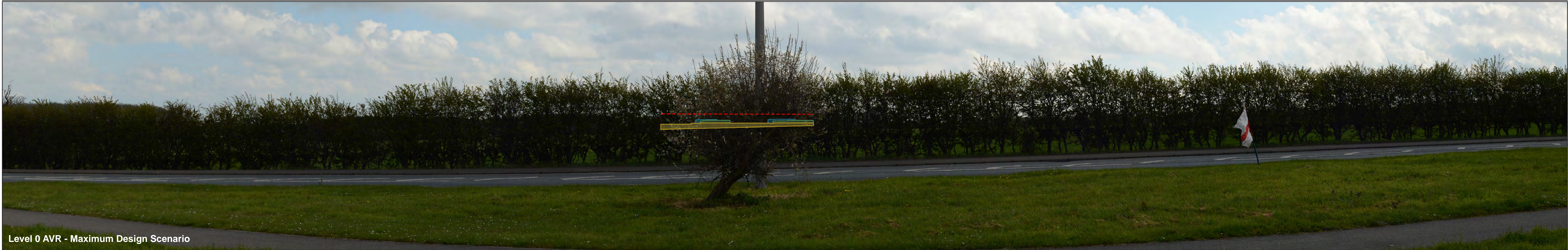
Figure: 13 Viewpoint 5: A164 layby near Bentley

EBI and Substation Area (15m Height) EBI Buildings (20m Height) Substation Buildings (25m Height) Lightning Protection (30m Height)