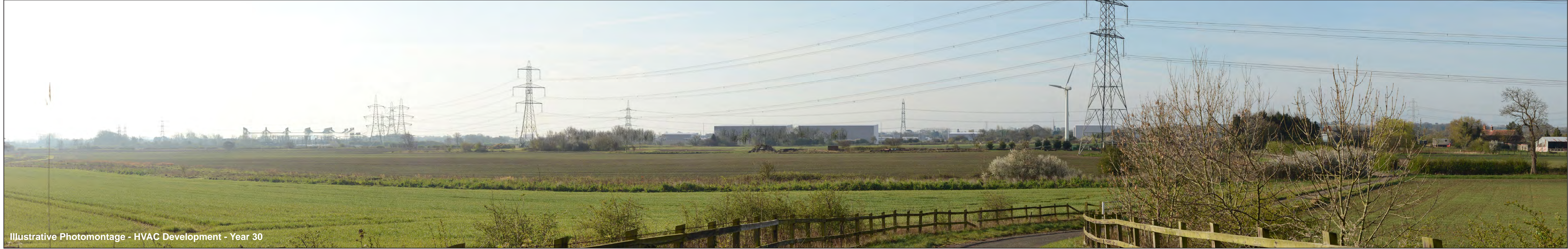
Illustrative Photomontage - HVAC Development - Year 30