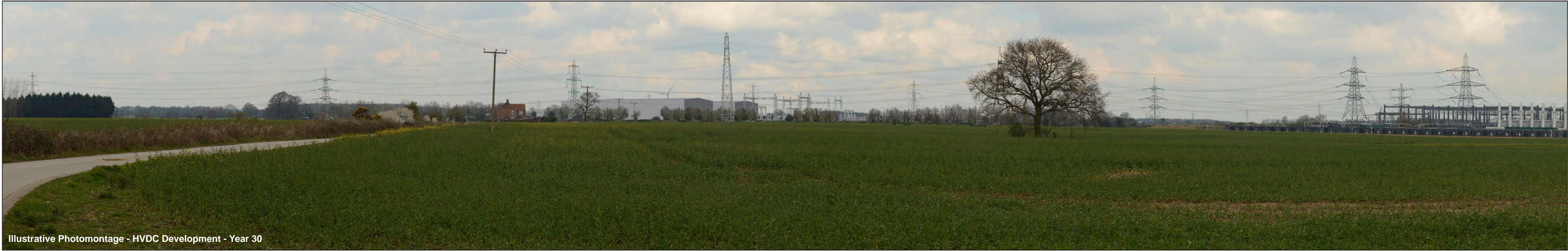
Illustrative Photomontage - HVDC Development - Year 30