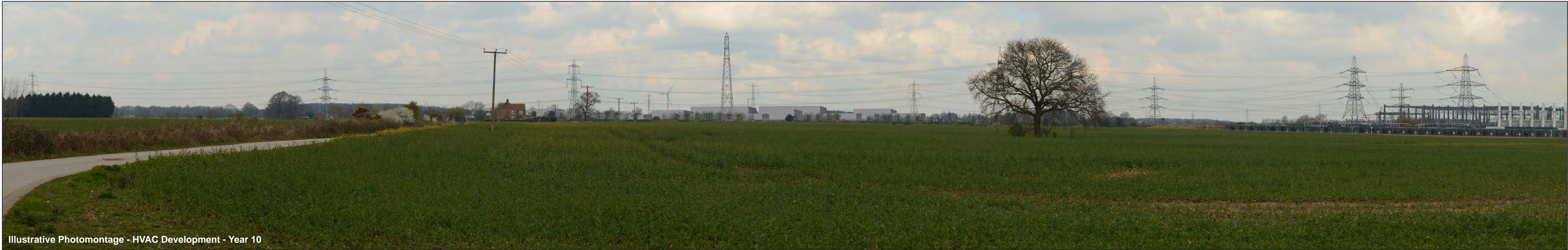
Illustrative Photomontage - HVAC Development - Year 10