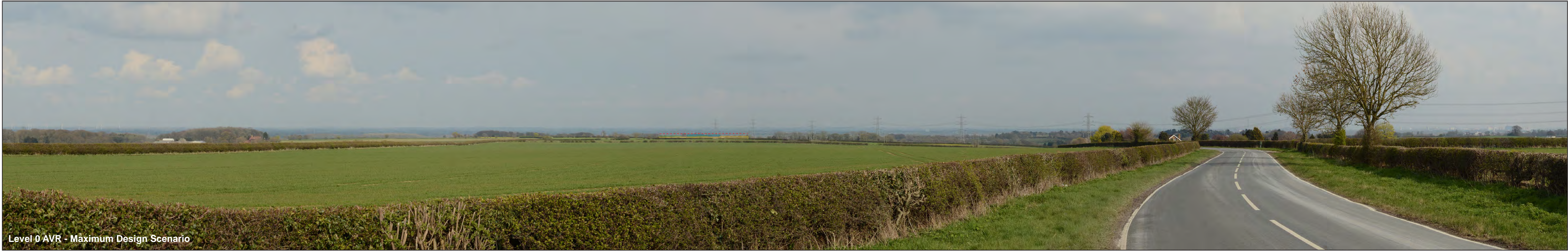
Figure: 15 Viewpoint 7: Little Weighton Road

EBI and Substation Area (15m Height) EBI Buildings (20m Height) Substation Buildings (25m Height) Lightning Protection (30m Height)