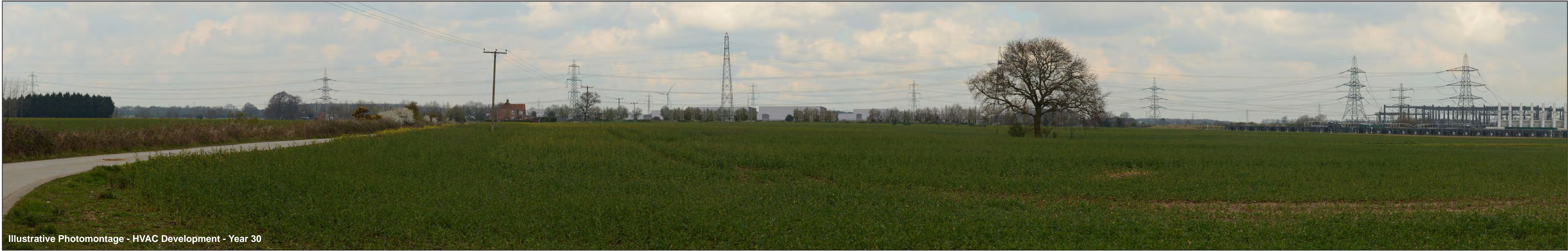
Illustrative Photomontage - HVAC Development - Year 30