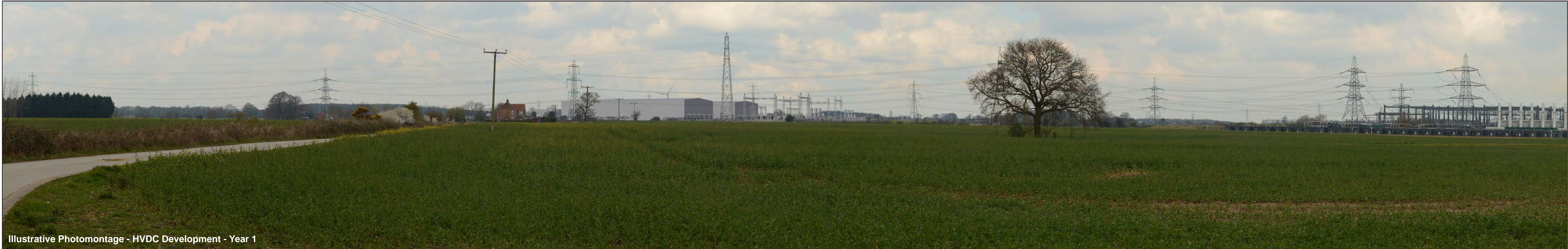
Illustrative Photomontage - HVDC Development - Year 1

This image provides landscape and visual context only