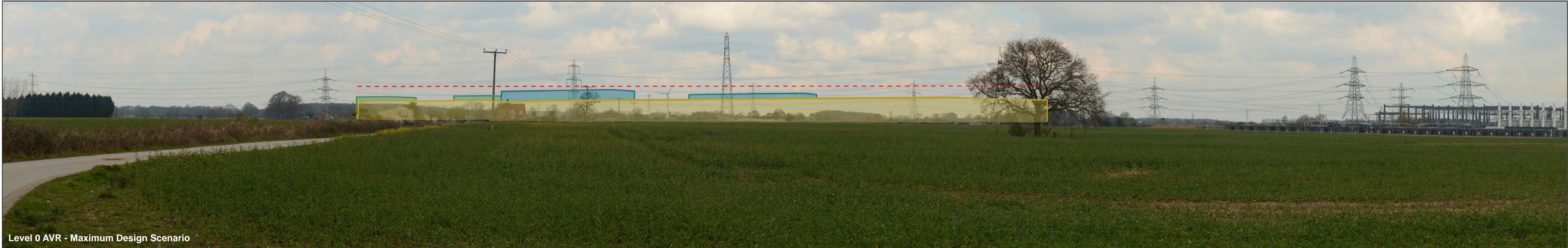
Figure 4 Viewpoint 2: Park Lane Cottingham

EBI and Substation Area (15m Height) EBI Buildings (20m Height) Substation Buildings (25m Height) Lightning Protection (30m Height)