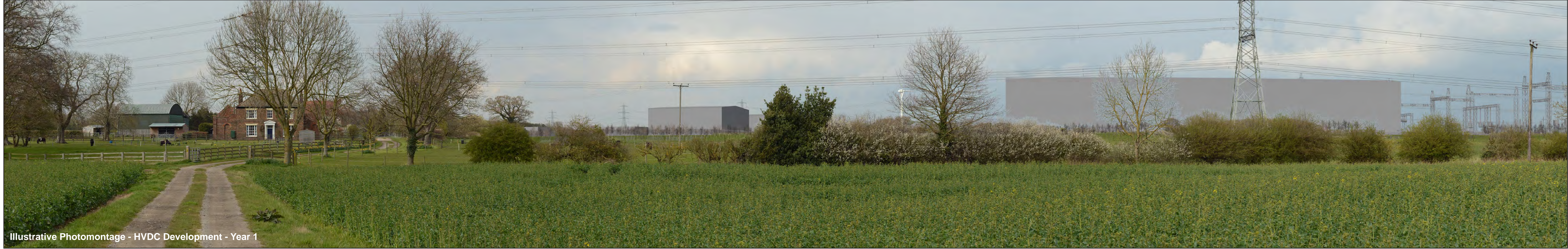
Figure: 2 Viewpoint 1: PRow South of Burn Park Farm

OS reference: 503721 E 434760 N Horizontal field of view: 90° (cylindrical projection) Camera: Nikon D600 AOD: 14.99 m Principal distance: 522 mm Lens: AF 50mm f/1.8D Direction of view: 335° Paper size: 841 x 297 mm (half A1) Camera height: 1.5 m AGL Distance to site: 0.24 km Correct printed image size: 820 x 260 mm Date and time: 03/04/2019 13:50