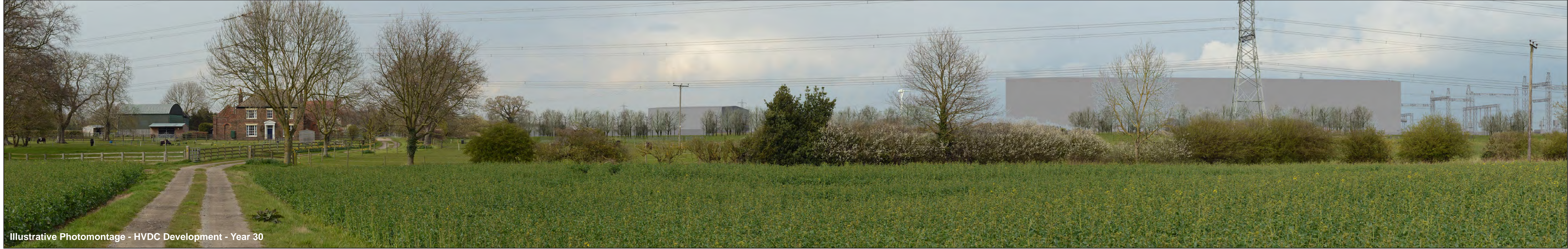
Illustrative Photomontage - HVDC Development - Year 30