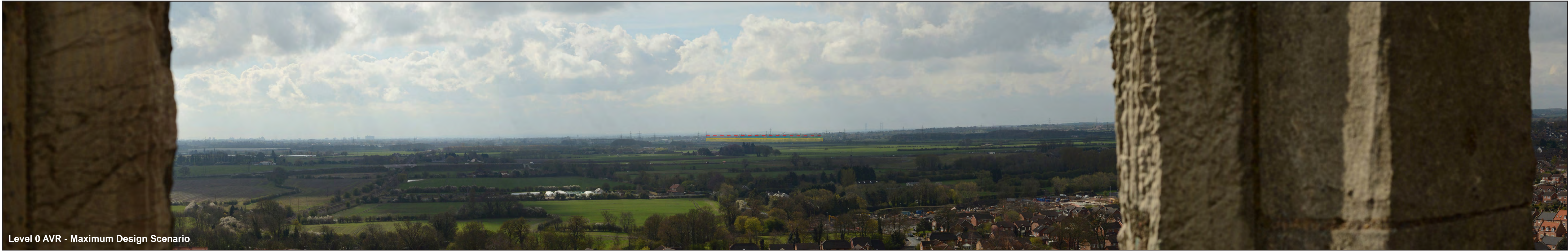
Level 0 AVR - Maximum Design Scenario

This image provides landscape and visual context only