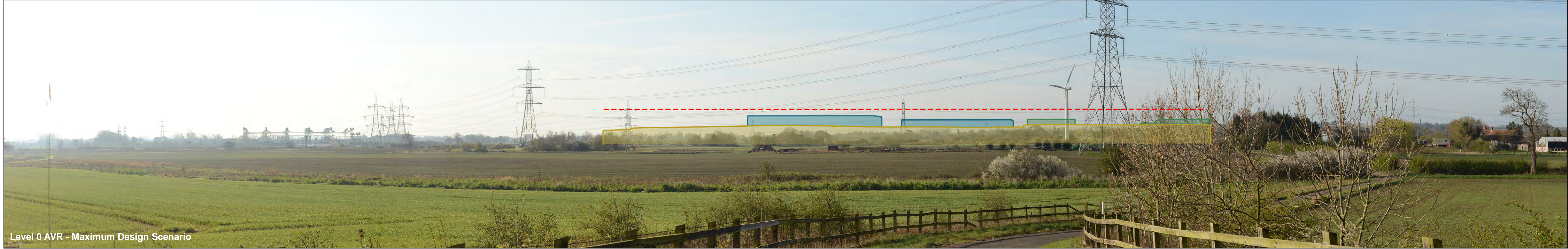
Level 0 AVR - Maximum Design Scenario