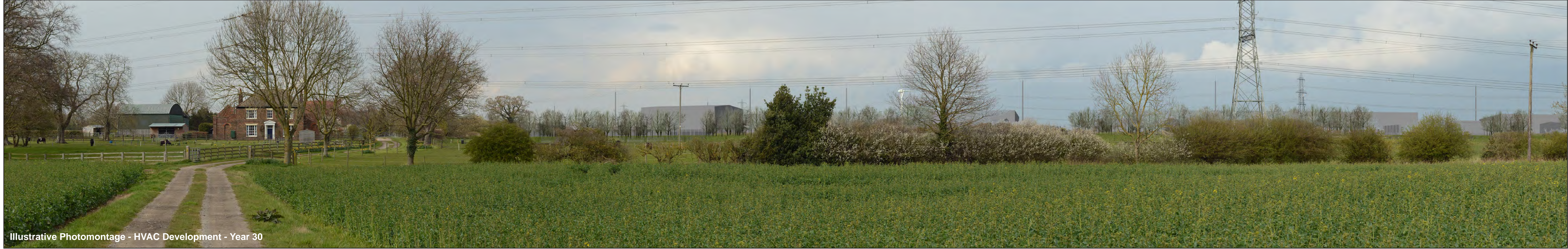
Illustrative Photomontage - HVAC Development - Year 30