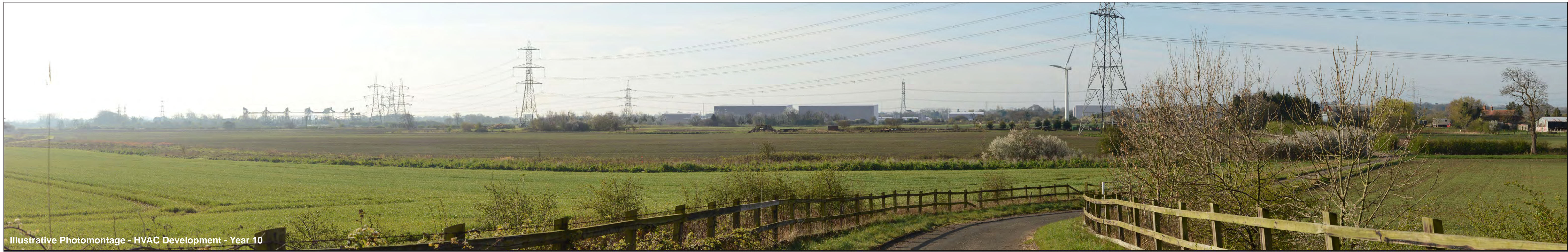
Illustrative Photomontage - HVAC Development - Year 10