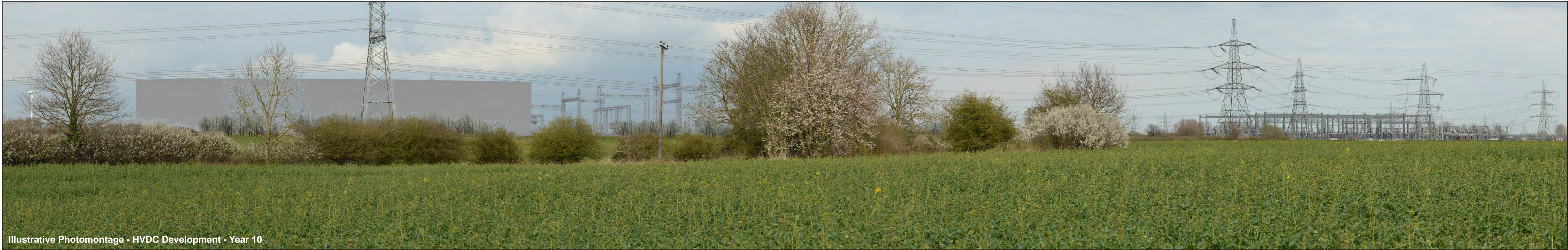
Illustrative Photomontage - HVDC Development - Year 10