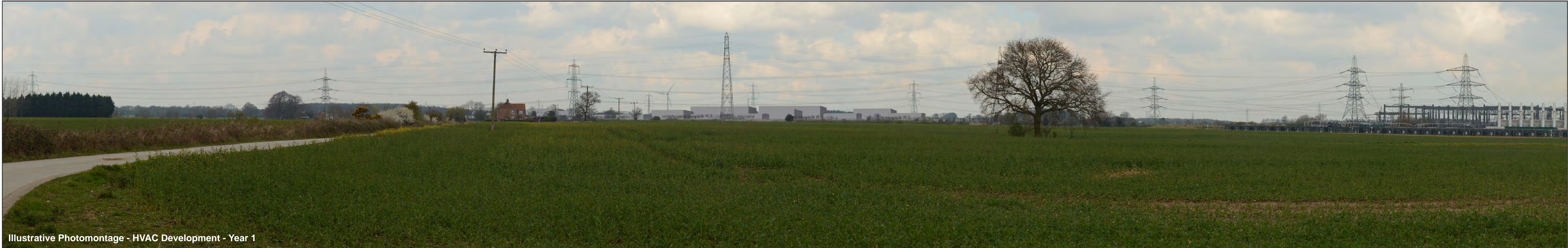
Illustrative Photomontage - HVAC Development - Year 1

This image provides landscape and visual context only