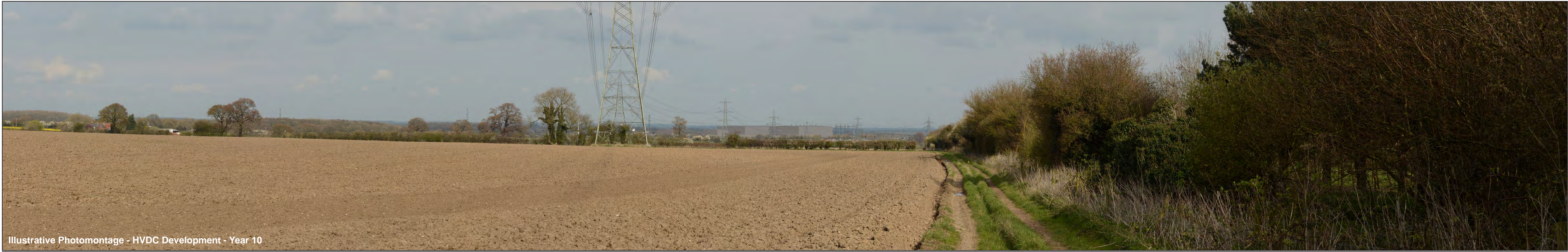
Illustrative Photomontage - HVDC Development - Year 10