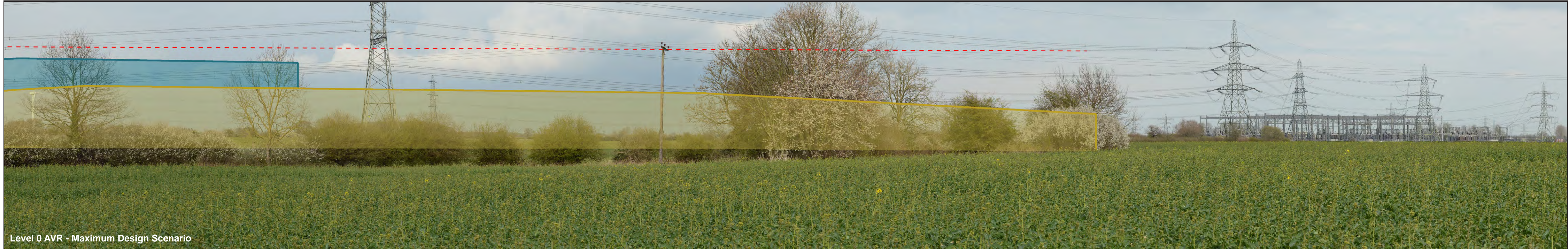
Figure: 1 Viewpoint 1: PRow South of Burn Park Farm

EBI and Substation Area (15m Height) EBI Buildings (20m Height) Substation Buildings (25m Height) Lightning Protection (30m Height)