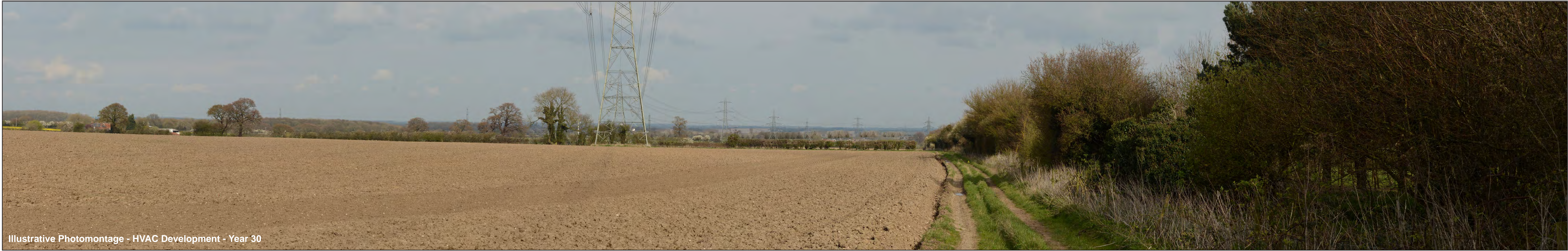
Illustrative Photomontage - HVAC Development - Year 30