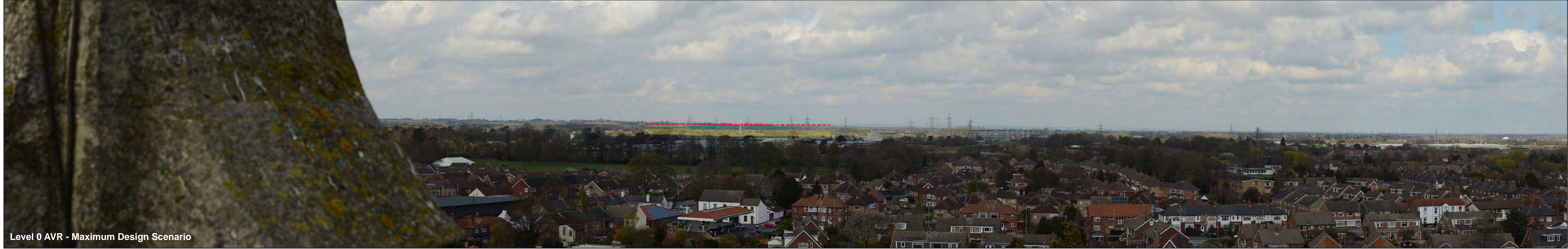
Level 0 AVR - Maximum Design Scenario

This image provides landscape and visual context only