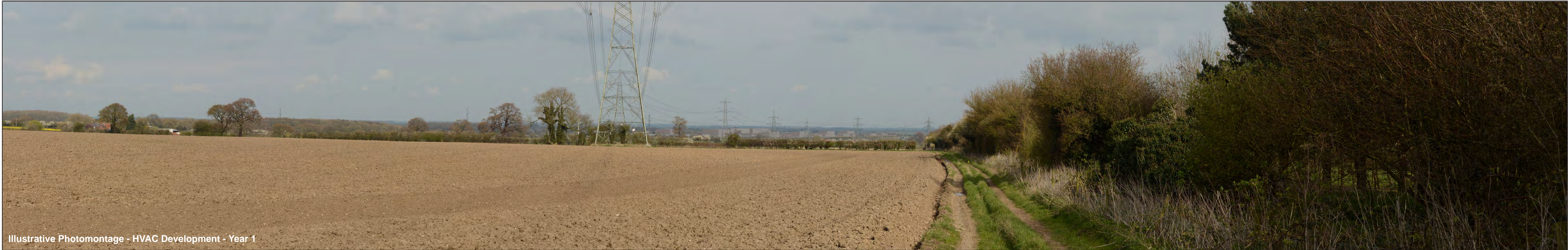
Illustrative Photomontage - HVAC Development - Year 1

This image provides landscape and visual context only