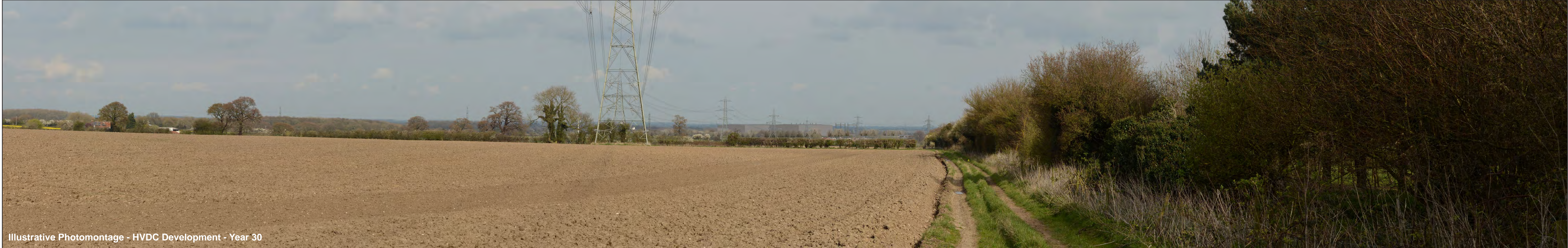
Illustrative Photomontage - HVDC Development - Year 30