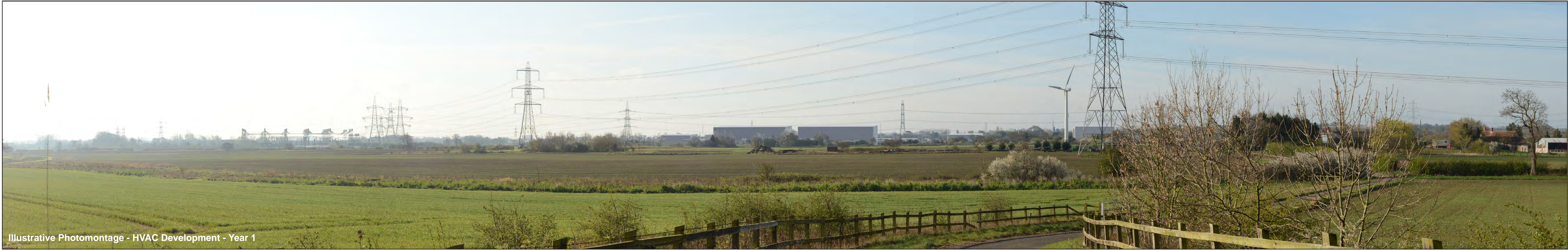
Figure: 23 Viewpoint 3: Footbridge over A1079

OS reference: 503831 E 435980 N Horizontal field of view: 90° (cylindrical projection) Camera: Nikon D600 AOD: 17.00 m Principal distance: 522 mm Lens: AF 50mm f/1.8D Direction of view: 175° Paper size: 841 x 297 mm (half A1) Camera height: 1.5 m AGL Distance to site: 0.67 km Correct printed image size: 820 x 260 mm Date and time: 04/04/2019 08:15