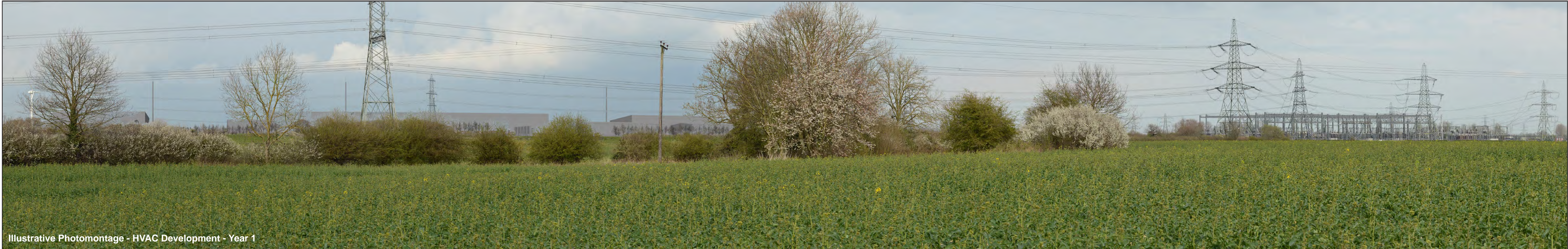
Figure: 19 Viewpoint 1: PRow South of Burn Park Farm

OS reference: 503721 E 434760 N Horizontal field of view: 90° (cylindrical projection) Camera: Nikon D600 AOD: 14.99 m Principal distance: 522 mm Lens: AF 50mm f/1.8D Direction of view: 70° Paper size: 841 x 297 mm (half A1) Camera height: 1.5 m AGL Distance to site: 0.24 km Correct printed image size: 820 x 260 mm Date and time: 03/04/2019 13:50