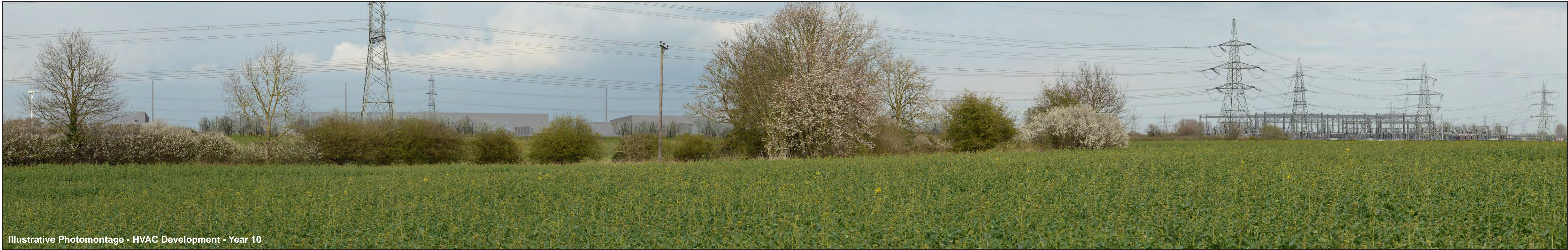
Illustrative Photomontage - HVAC Development - Year 10