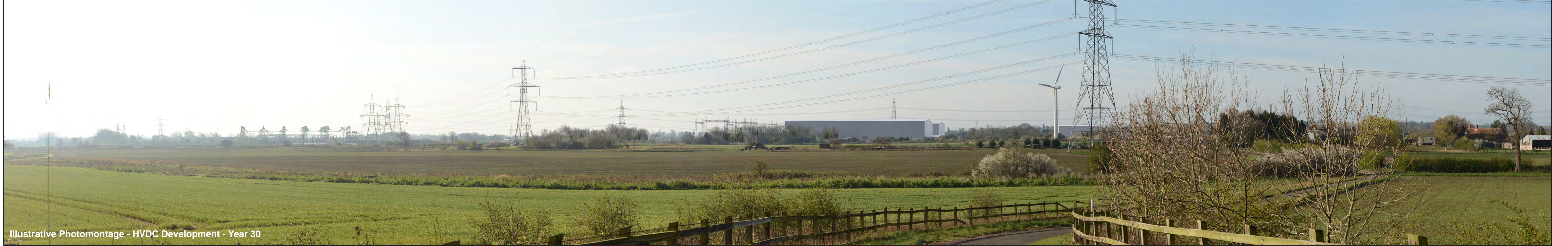
Illustrative Photomontage - HVDC Development - Year 30