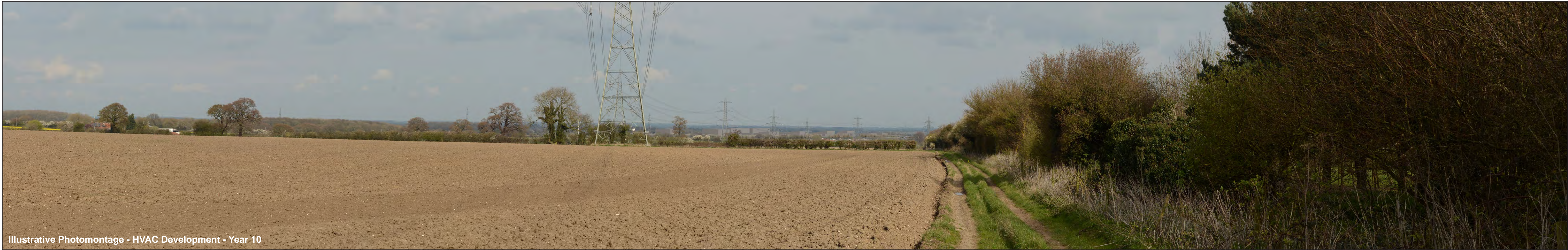
Illustrative Photomontage - HVAC Development - Year 10