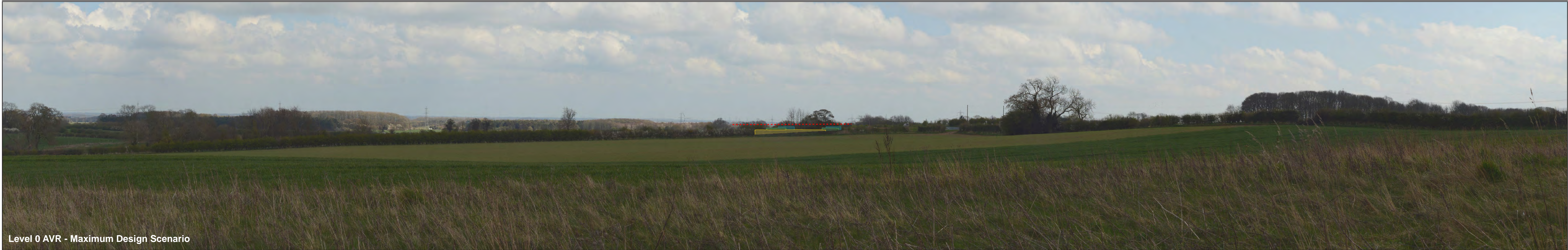
Figure: 14 Viewpoint 6: Fishpond Wood, Risby Hall

EBI and Substation Area (15m Height) EBI Buildings (20m Height) Substation Buildings (25m Height) Lightning Protection (30m Height)