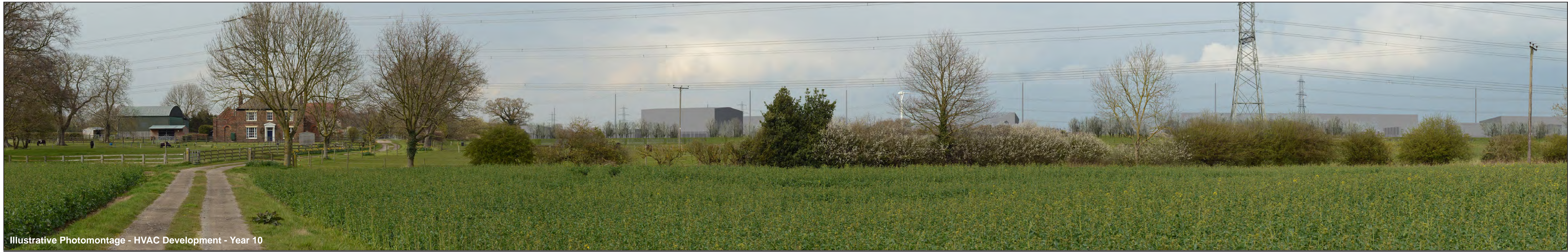
Illustrative Photomontage - HVAC Development - Year 10