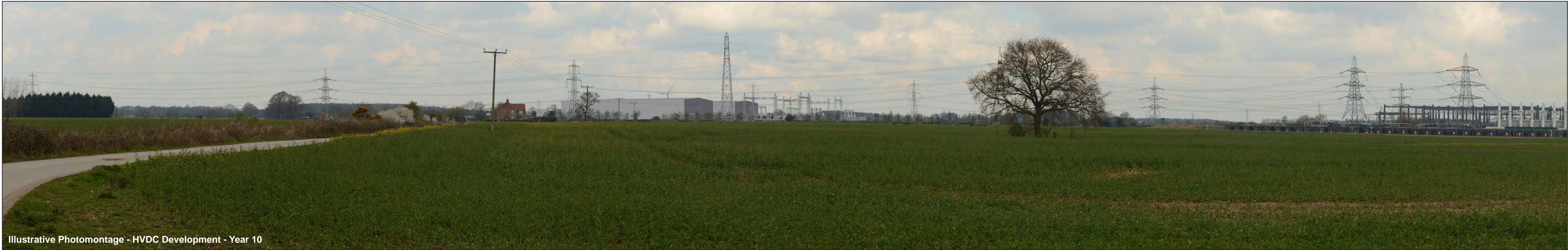
Illustrative Photomontage - HVDC Development - Year 10