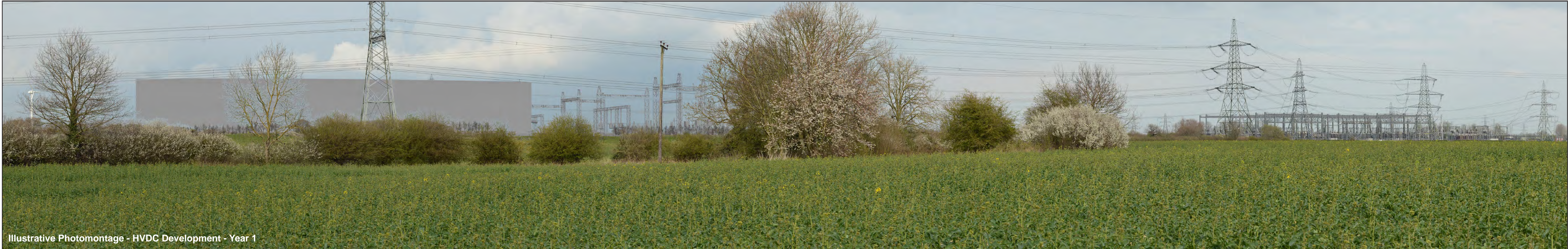
Figure: 2 Viewpoint 1: PRow South of Burn Park Farm

OS reference: 503721 E 434760 N Horizontal field of view: 90° (cylindrical projection) Camera: Nikon D600 AOD: 14.99 m Principal distance: 522 mm Lens: AF 50mm f/1.8D Direction of view: 70° Paper size: 841 x 297 mm (half A1) Camera height: 1.5 m AGL Distance to site: 0.24 km Correct printed image size: 820 x 260 mm Date and time: 03/04/2019 13:50