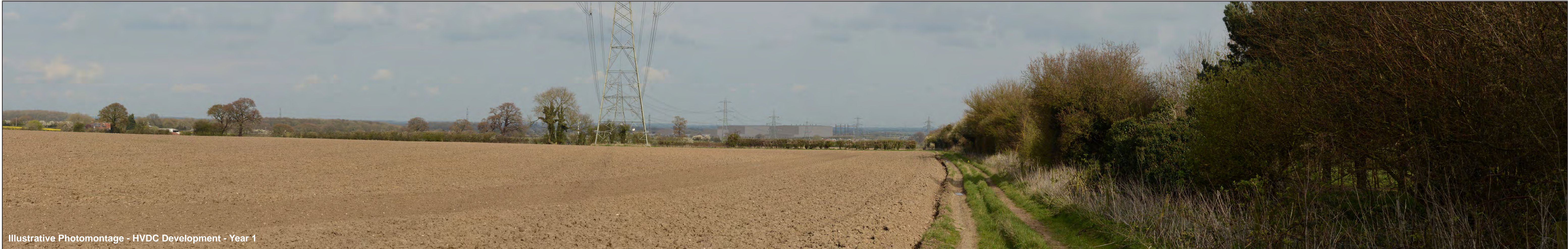
Figure: 11 Viewpoint 4: PRoW East of A164

OS reference: 502255 E 434521 N Horizontal field of view: 90° (cylindrical projection) Camera: Nikon D600 AOD: 35 m Principal distance: 522 mm Lens: AF 50mm f/1.8D Direction of view: 70° Paper size: 841 x 297 mm (half A1) Camera height: 1.5 m AGL Distance to site: 1.36 km Correct printed image size: 820 x 260 mm Date and time: 03/04/2019 14:30