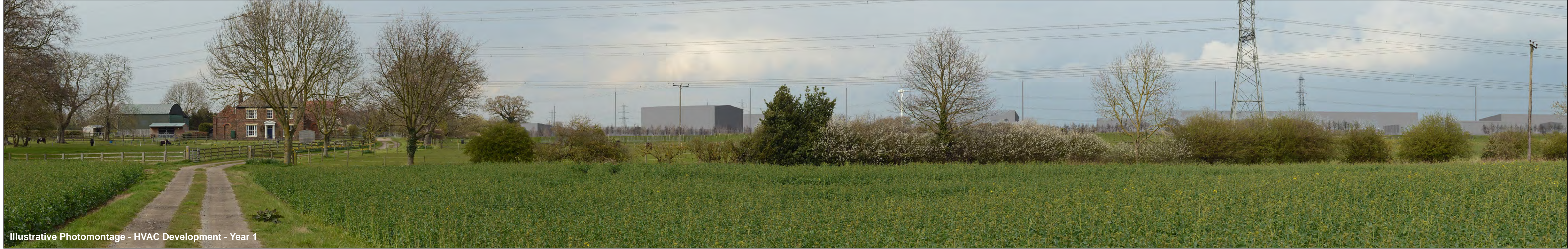
Figure: 19 Viewpoint 1: PRow South of Burn Park Farm

OS reference: 503721 E 434760 N Horizontal field of view: 90° (cylindrical projection) Camera: Nikon D600 AOD: 14.99 m Principal distance: 522 mm Lens: AF 50mm f/1.8D Direction of view: 335° Paper size: 841 x 297 mm (half A1) Camera height: 1.5 m AGL Distance to site: 0.24 km Correct printed image size: 820 x 260 mm Date and time: 03/04/2019 13:50